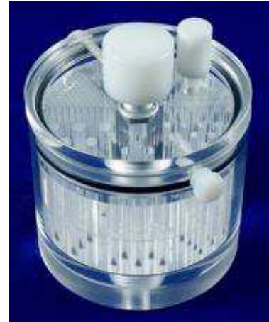
Mini Hot Spot Phantom™