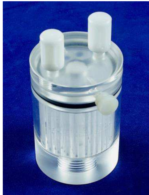
Micro Hot Spot Phantom™