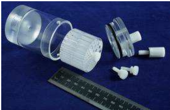
Components of Micro Hot Spot Phantom™