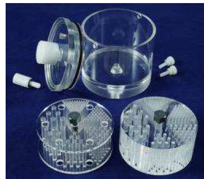
Components of Mini Deluxe and Hot Spot Phantom™