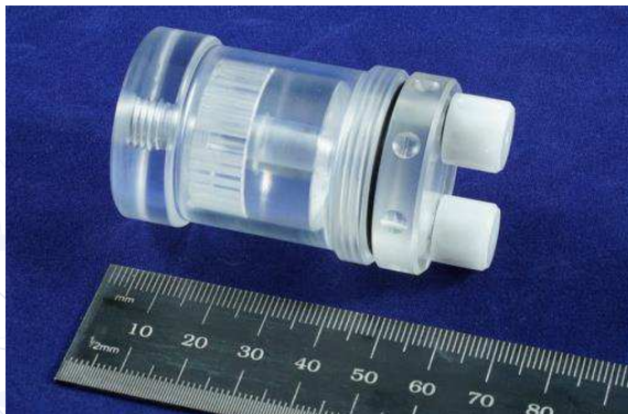
Ultra-Micro Hot Spot Phantom™