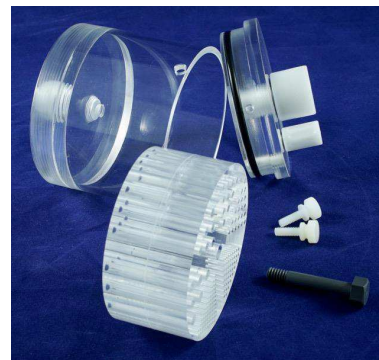
Components of Mini Hot Spot Phantom™